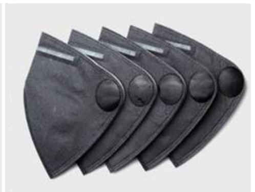
Sample Changeable Filter Set Type 9001 NanoScreen™