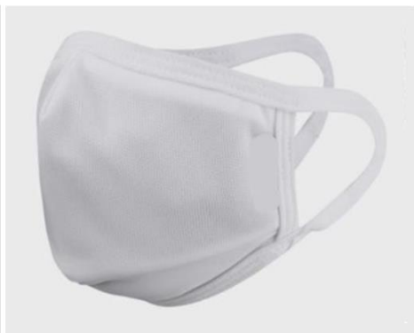
Sample Reusable Mask Type 9002 NanoMask White