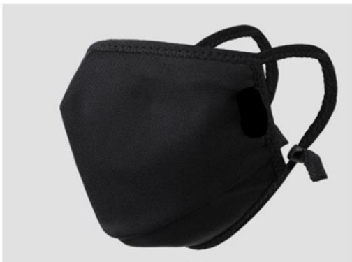
Sample Reusable Mask Type 9002 NanoMask Black

NanoScreen™ Functional Core Technology Inside